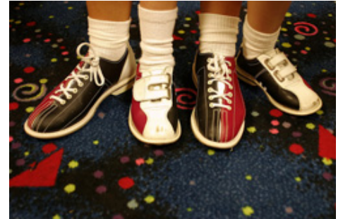
We're going bowling! August 18 th !

In July several members and their guests enjoyed a delightful PWN evening of social networking the old fashioned way. We didn't text or Facebook™, but met face to face to see the wonderful production "Wicked" at the Orpheum Theater. One of the great values of PWN is strengthening relationships with other members by attending outside events.